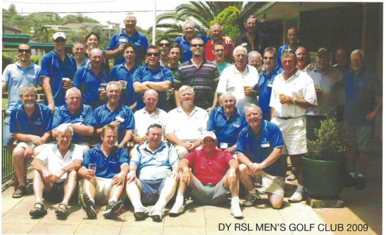
DY RSL MEN'S GOLF CLUB 2009