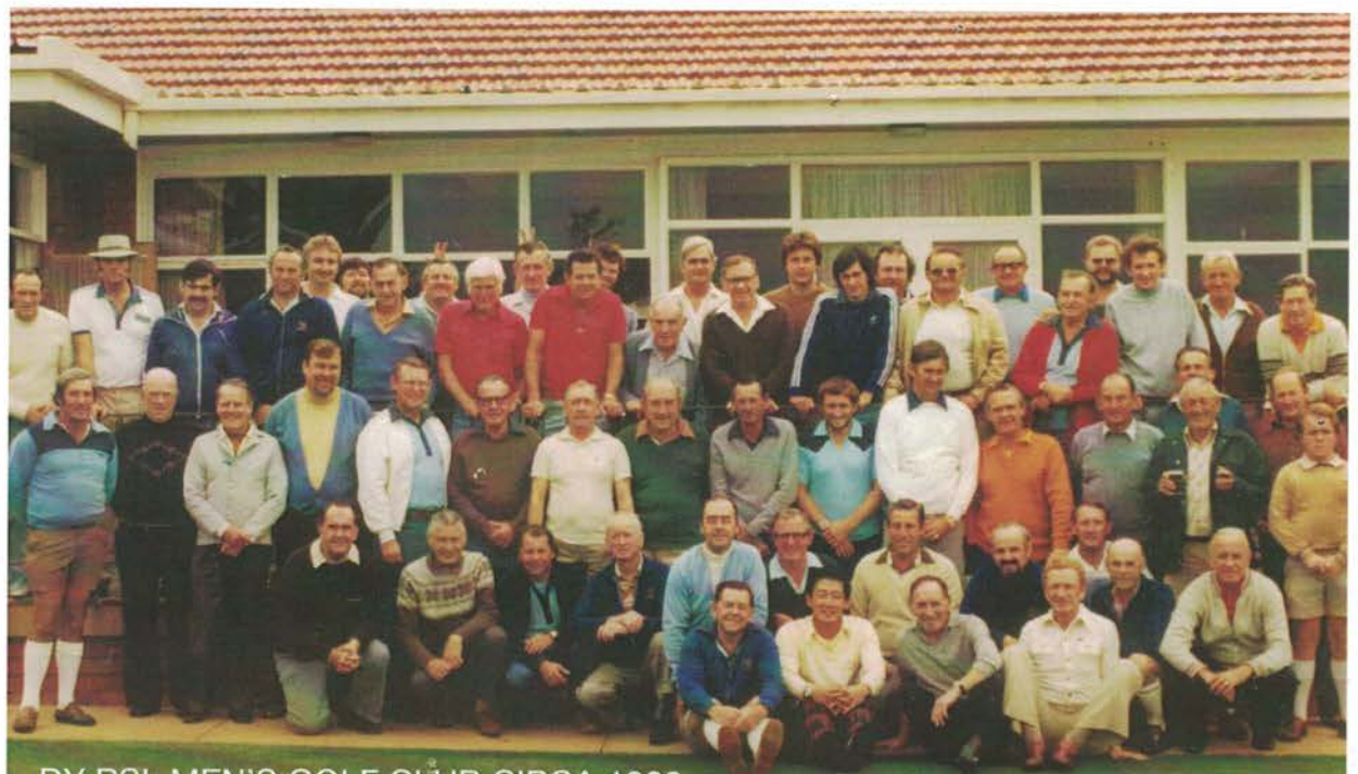
DY RSL MEN'S GOLF CLUB CIRCA 1980