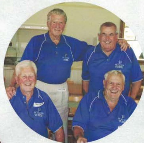
The 300 Club