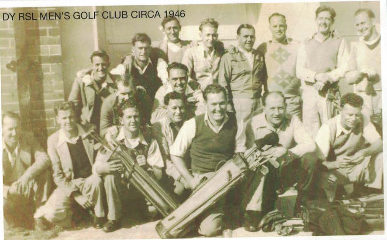
DY RSL MEN'S GOLF CLUB CIRCA 1946